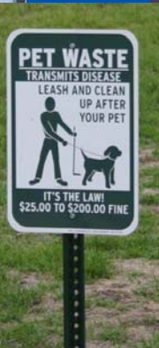
Pet Waste Ordinances